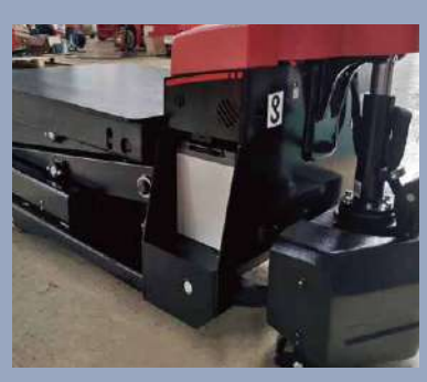
The batteries can be removed conveniently, for easier maintenance and disassembly