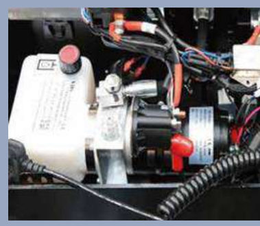
Integrated hydraulic unit, compact structure less space