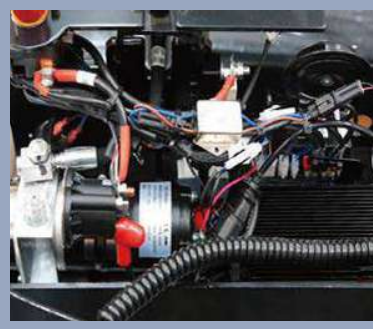
One-piece cover, covering almost all important components, convenient for maintenance